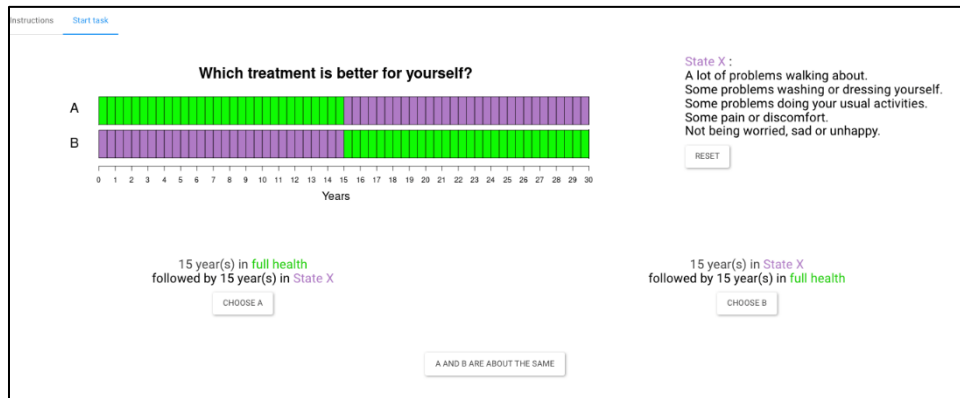
Figure 1. Screenshot of a time preference task

In formal terms, Profile A is denoted by ([t_0, t_{0.5}], \gamma; [t_{0.5}+1, T], \beta) and Profile B is denoted by ([t_0, t_{0.5}], \beta; [t_{0.5}+1, T], \gamma) , where t_0 is the starting point of the considered episode (year 0 in Figure 1) and T is the end point (year 30). The time point t_{0.5} is looked for, such that the respondent is indifferent between the two profiles: ([t_0, t_{0.5}], \gamma; [t_{0.5}+1, T], \beta) \sim ([t_0, t_{0.5}], \beta; [t_{0.5}+1, T], \gamma) . In the general QALY model, this indifference is represented as follows: