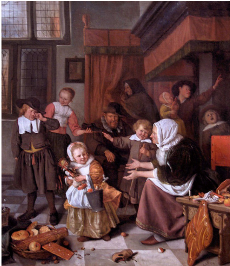
Desert at work. The feast of St. Nicholas, Jan Havicksz. Steen, 1665-1668.