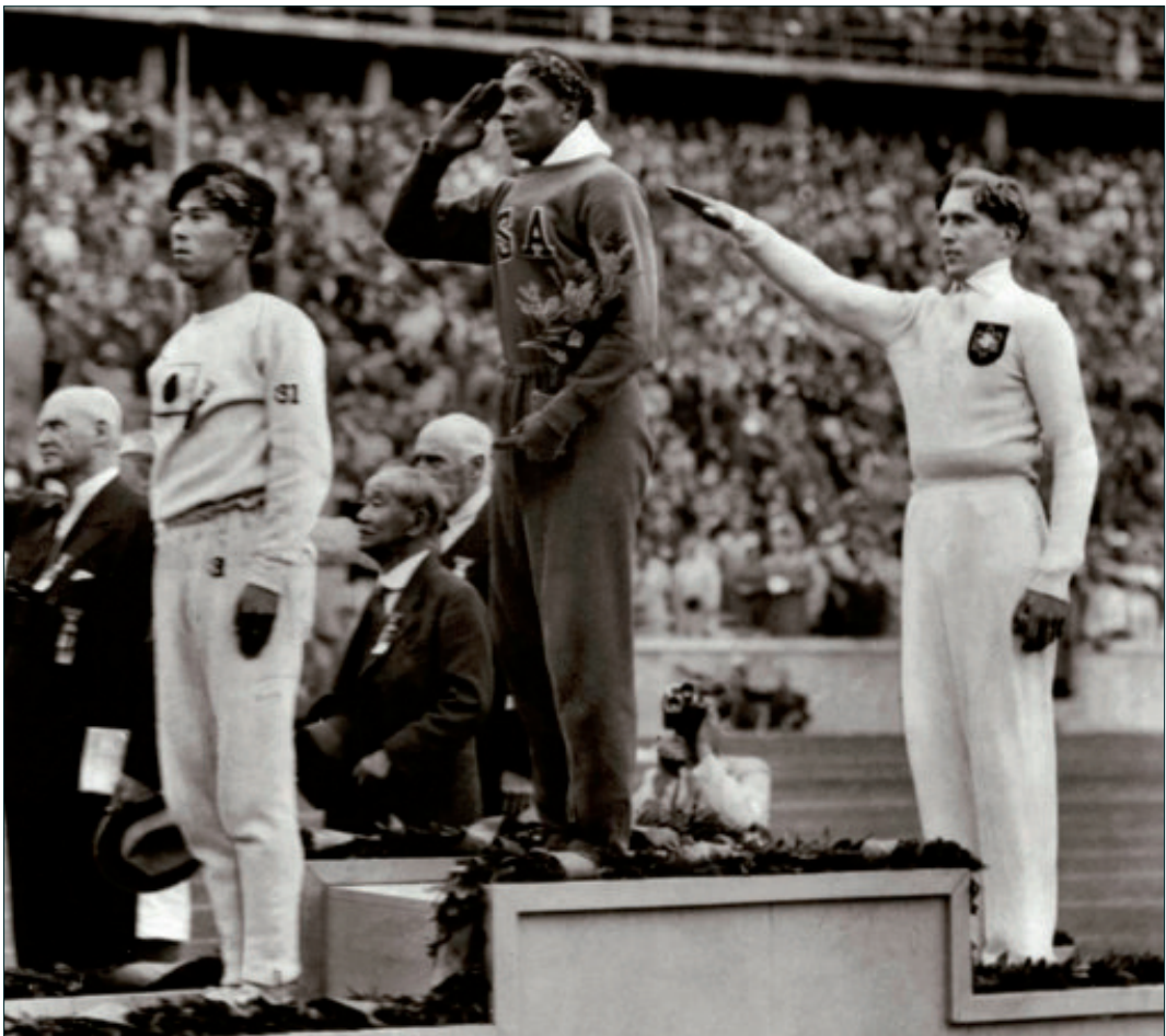
Jesse Owens wins the long jump at the Olympic Games in Berlin in 1936.

theory by winning four medals. Owens himself took a slightly different view. Owens' memories of Berlin in 1936 were very positive: he stayed at the same Berlin hotels as white people did, which was not always the case in the United States. Racism was not only a German problem, it was also a problem in the United States. Owens maintained very cordial relations with the German athlete Lutz Long. He observed several times that he had encountered racism a lot less in Germany than he did after his return to the United