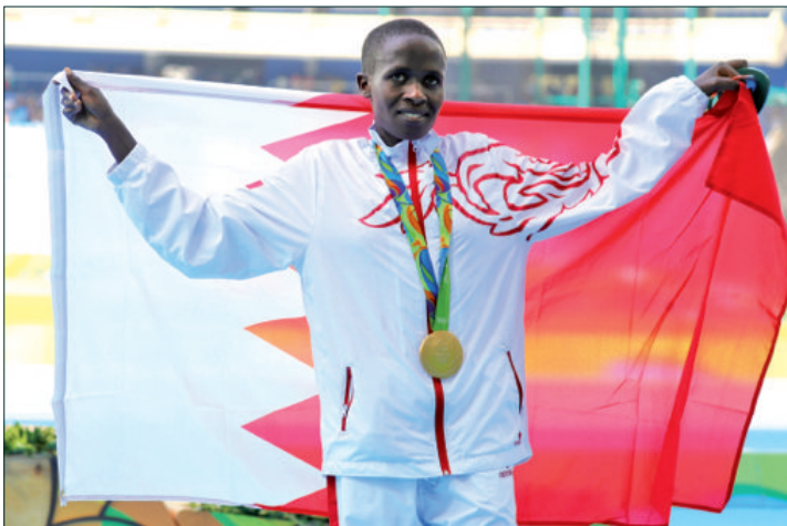
Ruth Jebet of Kenyan descent poses for Bahrain with her gold medal on the podium after winning the 3000m Steeplechase during the Olympic Games 2016.

Knowing that she was Kenyan 'in her heart of hearts', the Kenyan population adored her and cheered her on. Kenyan athletics association officials, however, were not quite so delighted. They felt that they had been investing in Jebet's and other athletes' talent for many years, and for them it was very bitter indeed to see how their best talents were being poached and were now playing for other countries. This was not what their talent programme had set out to achieve. 15