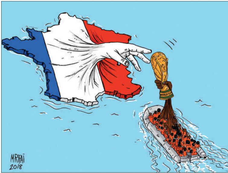
Migrants hand France the World Cup.