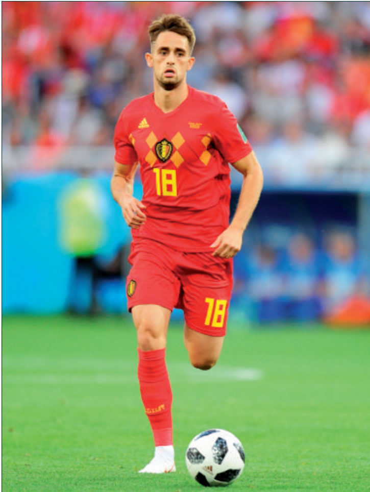
Adnan Janzaj plays for Belgium in 2018.