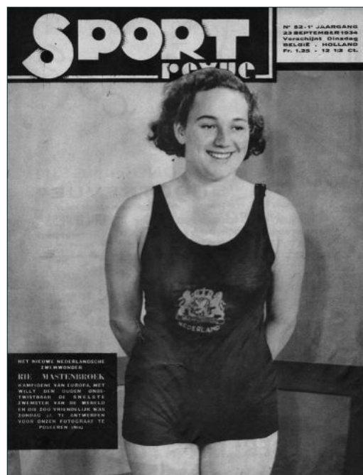
Dutch swimmer Rie Mastenbroek at the Olympic Games in Berlin in 1936.

Both in the United States and in the Netherlands, there had been a strong call to boycott the 1936 Olympic Games.