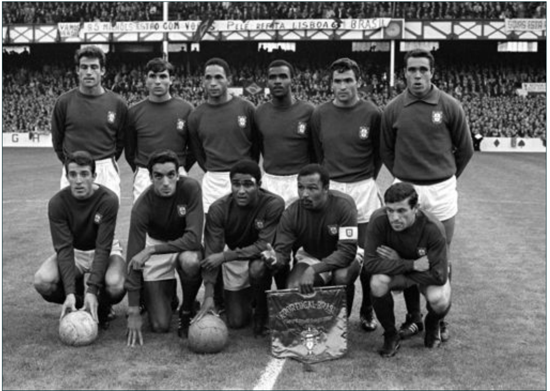
The Portuguese team in 1966. Eusebio da Sylva Ferreira in the bottom row, third from the left.

Eusébio himself later professed that he had, to all intents and purposes, been Salazar's slave, entirely dependent on him for his passport and his travels. 22